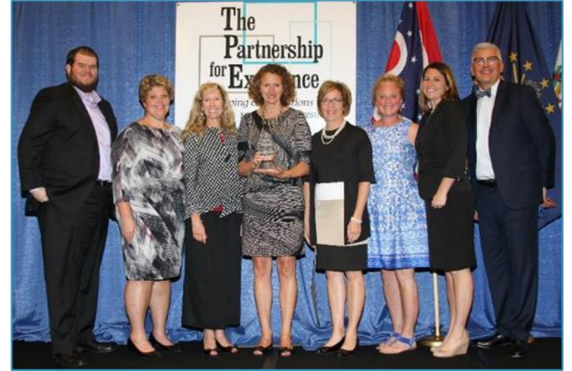
Memorial Hospital and Health Care Center Jasper, IN - 2016