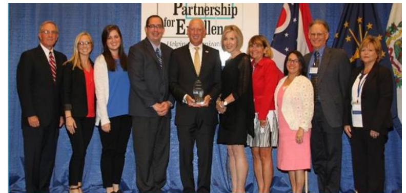
Six Disciplines Consulting Services, Findlay, OH