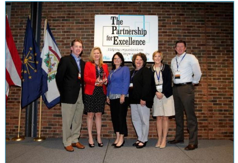
Mon Health, Morgantown, WV