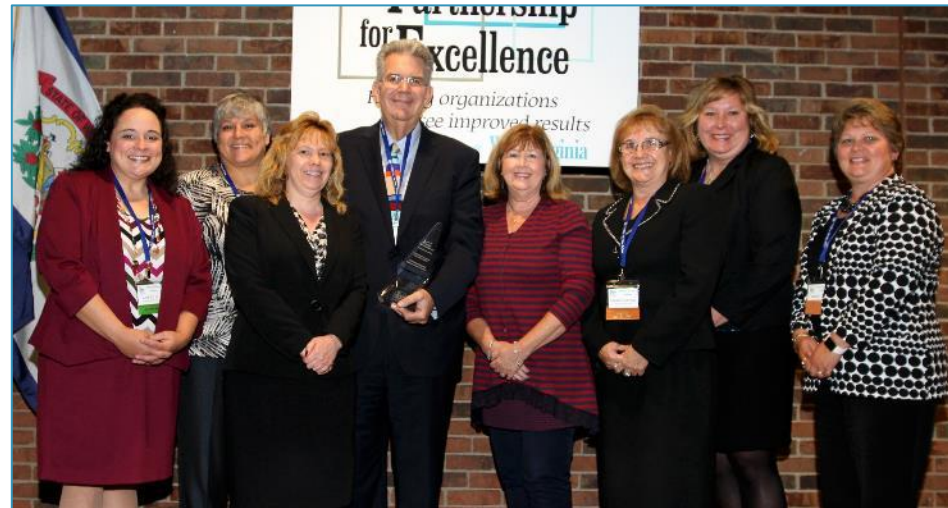
University Hospitals Geauga Medical Center Chardon, OH - 2017