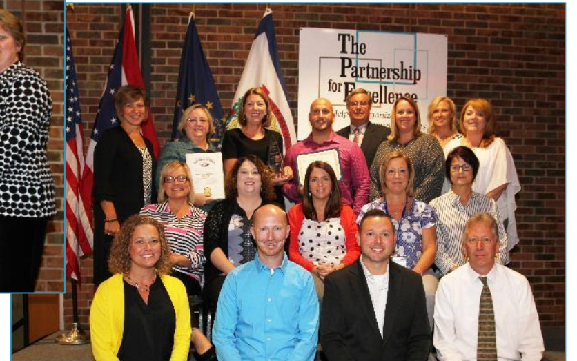
ProMedica Memorial Hospital, Fremont, OH - 2018