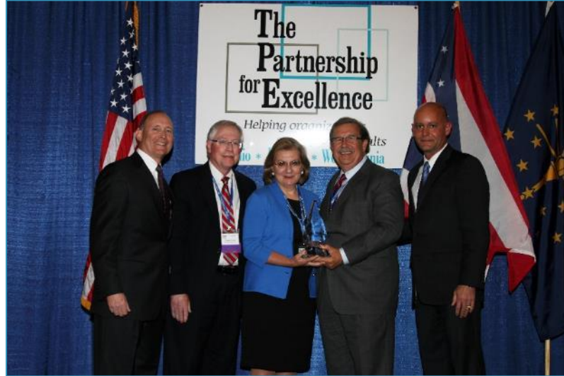
CAMC Health System, Charleston, WV