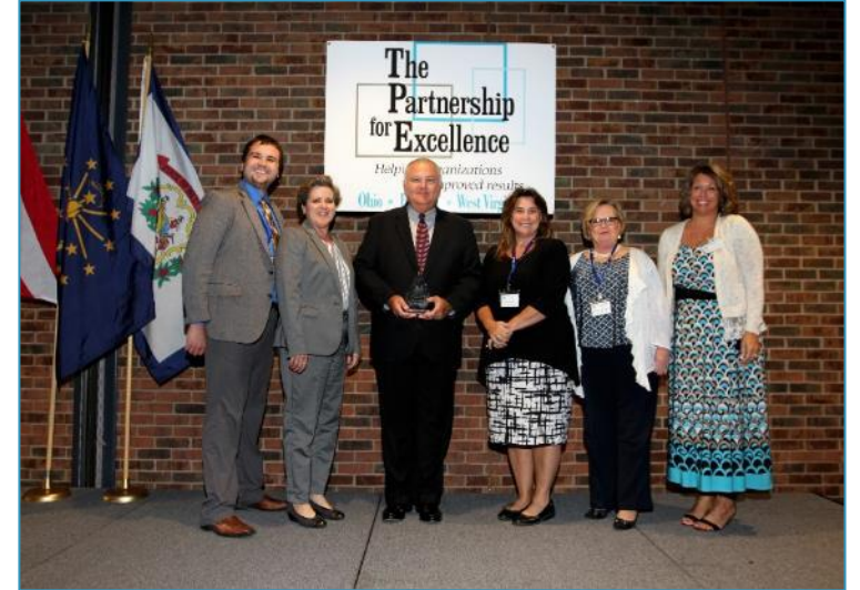
WVU Camden Clark, Parkersburg, WV