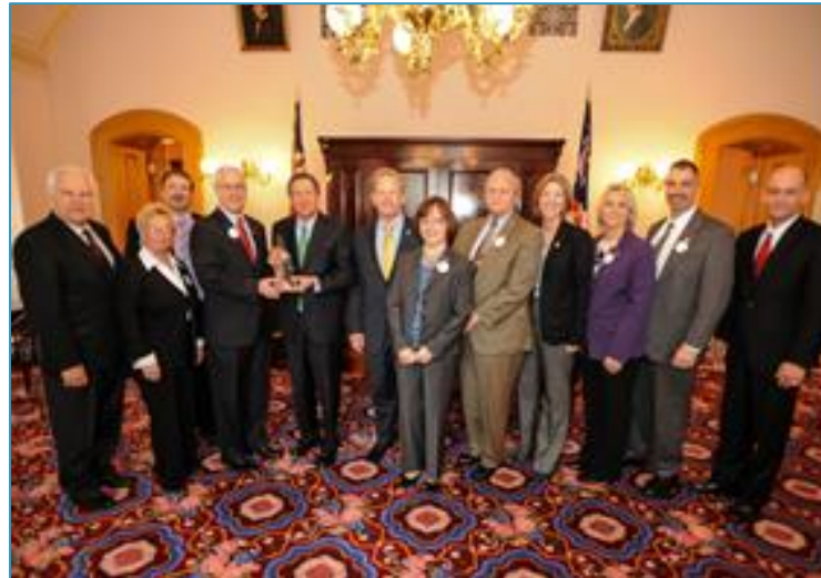
Flower Hospital, Sylvania, OH - 2012