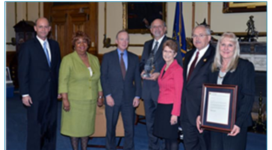
Citizens Energy, Indianapolis, IN - 2012