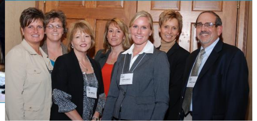
Schneck Medical Center, Seymour, IN - 2011