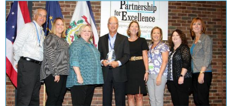
ProMedica, Toledo, OH