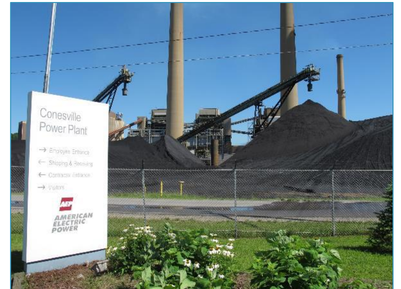
American Electric Power, Conesville, OH