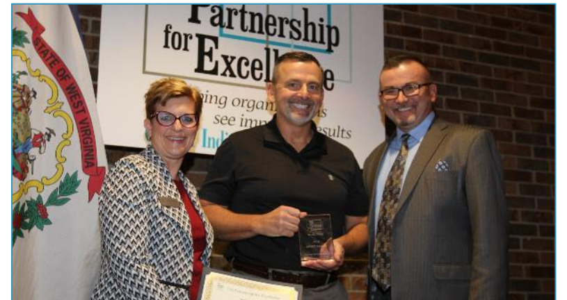
Clabber Girl Corporation – Spirit Award Terra Haute, IN