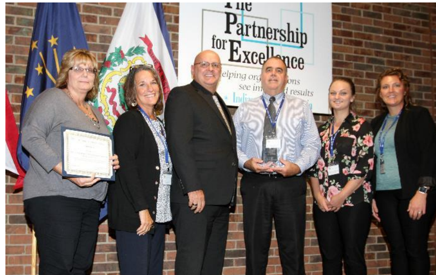
Perry County Board of DD, New Lexington, OH