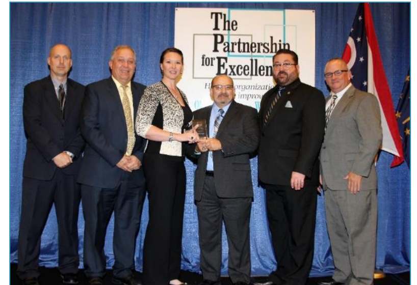
Braun Ambulance, Van Wert, OH