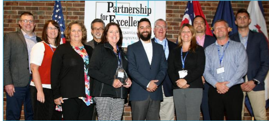
Hendricks Regional Health, Danville, IN