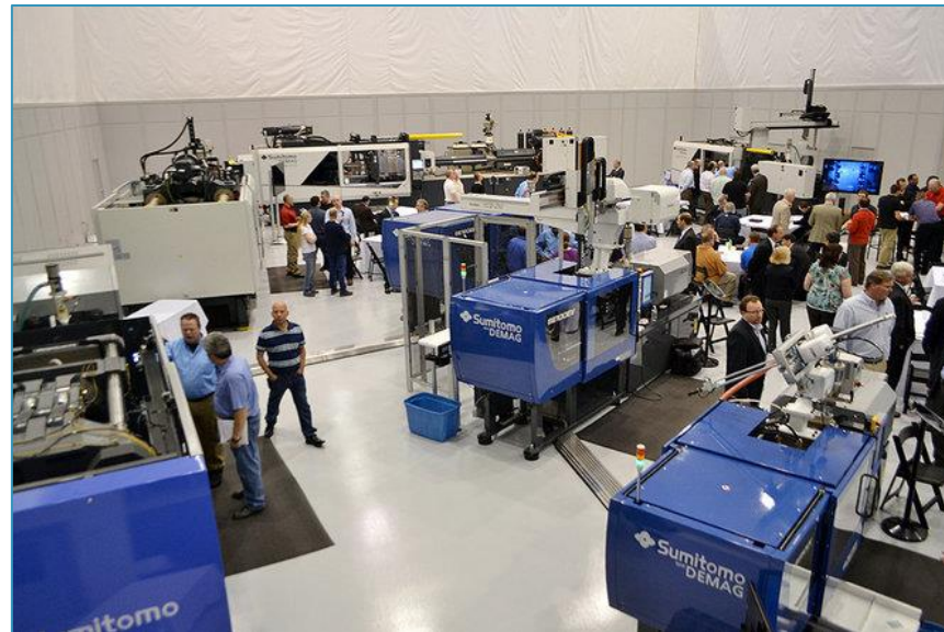
Van Dorn Demag Corporation, Strongsville, OH