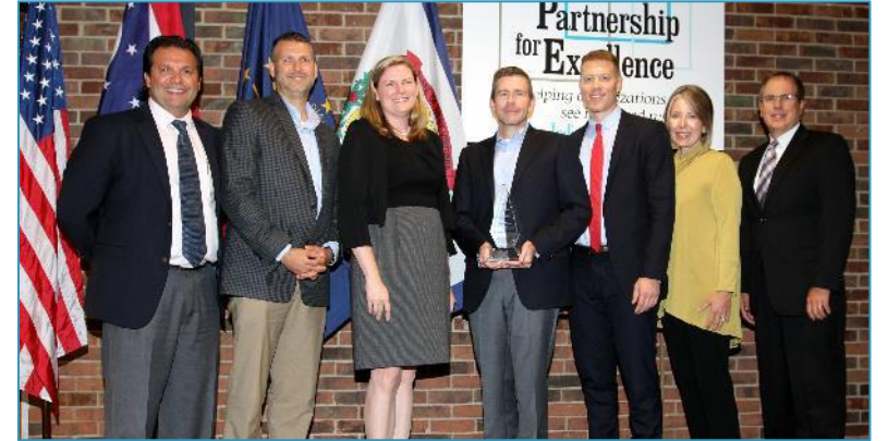
Managed Healthcare Services, Lilly USA Indianapolis, IN