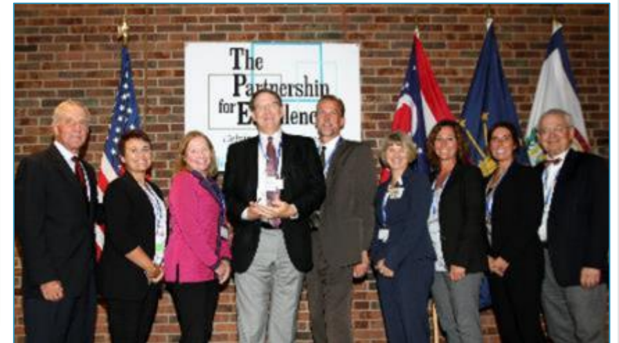
Blanchard Valley Health System, Findlay, OH - 2019